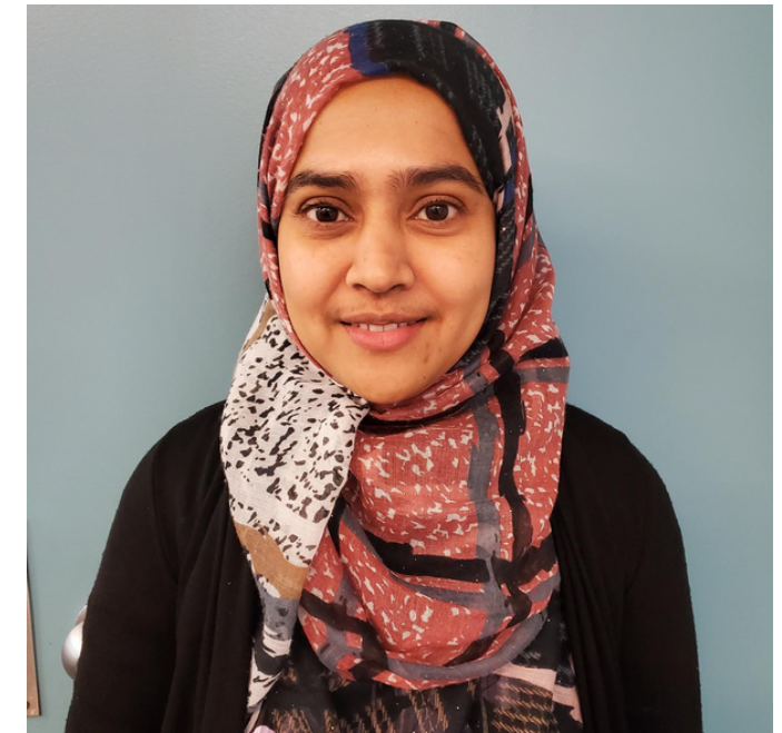
Ginnut Gaffrin Office & Services